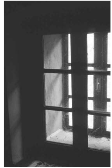
Slovak Farmhouse: (Left) Front door and window; (Right) Window from inside.

Each window contains four separate sashes, hinged on their sides. Two open outward and, separated by the wall's thickness, two open inward. Each sash can be independently adjusted. For example, all the sashes can be either closed or opened. Another possibility is that outside sashes can be either opened or closed while inside ones are opposite. Finally there are different versions where only one sash is opened on the outside and only one on the inside. When combined with degrees of opening of each sash, the possibilities for effective responses to sun, wind, and water are both subtle and many.