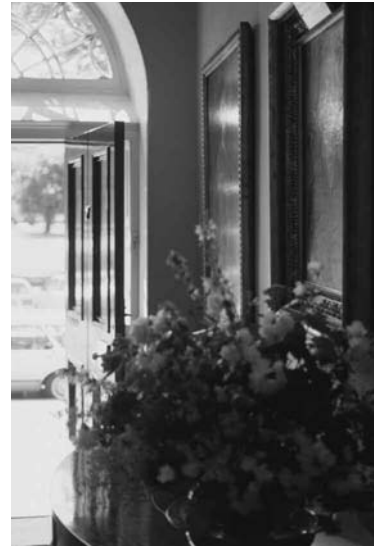
Georgian House, Edinburgh.

Inside, the window can be seen to have additional means of adjustment. Flanking wood panels open to expose collapsible shutters that filter sunlight. Drapes lower or pull aside to provide still more layers, each independently adjustable.